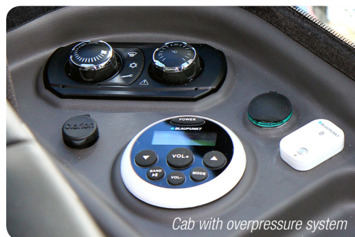
Cab with overpressure system