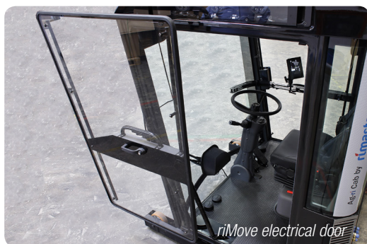
riMove electrical door