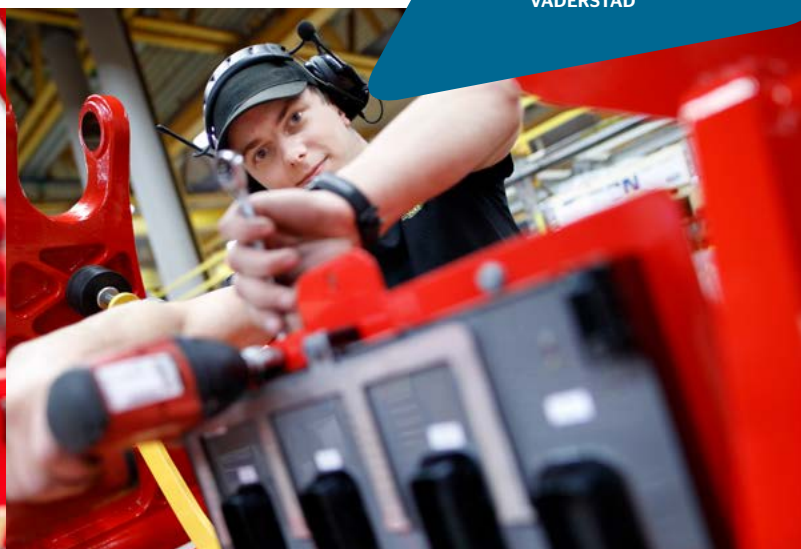
Picture left: Power Shoot – a pressurized feeder system affording full control, all the way down to the soil. Picture right: Mounting the WS9 control unit.

Realizing such speed and high-level precision is no small matter. However, in modern agriculture, it is crucial for profitability and productivity. When Väderstad launched its Tempo planters, it revolutionized the industry. Tempo is a precision planter that delivers unprecedented precision at twice the speed of traditional precision planters. The result is a smooth appearance where the crop gets the best possible start.