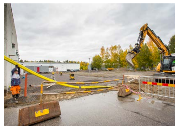
The construction of new production areas and offices is in full swing.